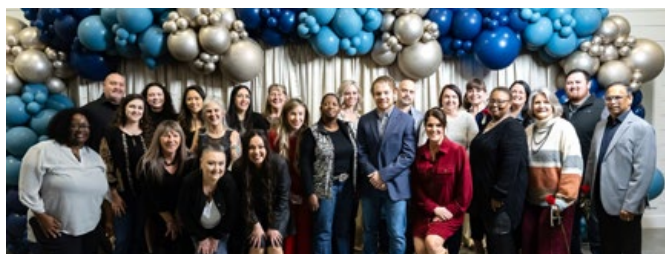
Paris Regional Health team members attended the Years of Service awards banquet.