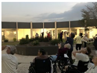
Hospital staff and patients observed the eclipse together on April 8, 2024.